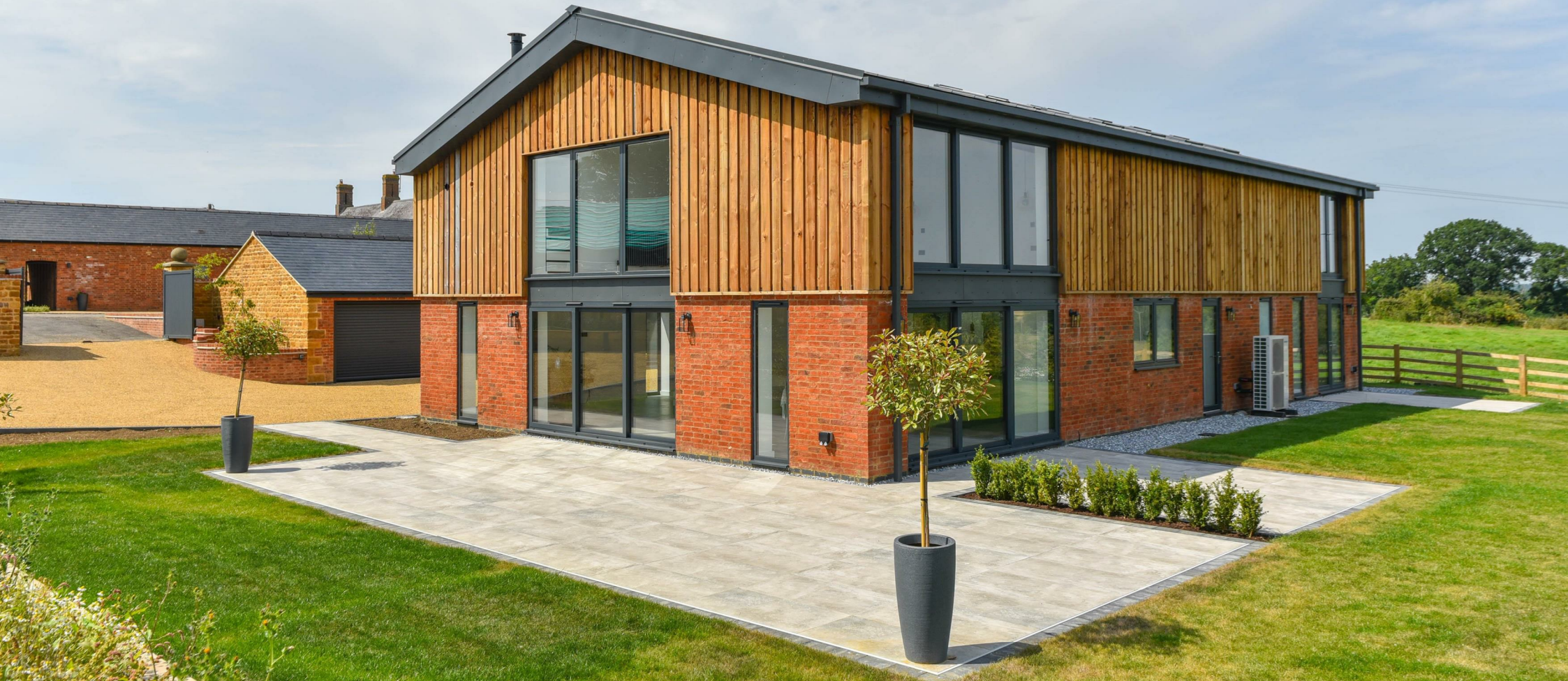
The Grain Barn Steeple Lane, Little Brington, Northampton, NN7 4HN